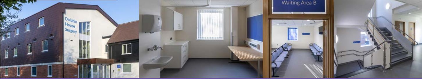
Dolphin House Surgery, Ware

The existing building, which had once been used as a Fire Station, Community Police Station and CAB required refurbishment and extension. Being adjacent to the River Lea, and close to the main culvert overflow, there were many design considerations taken into account. The finished design incorporated a GP practice, pharmacy and offices. The project achieved a 'Very Good' BREEAM rating.