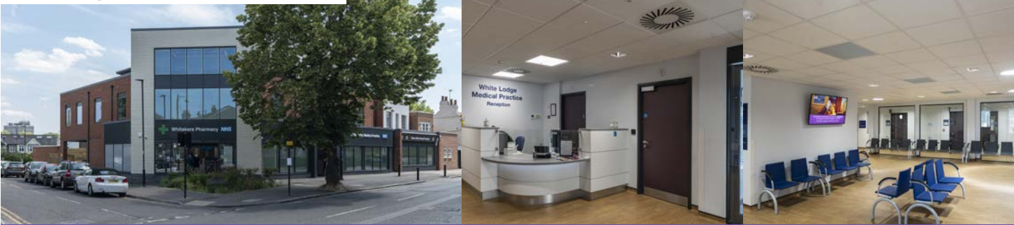
White Lodge Medical Centre, Enfield

A new purpose built medical centre comprising part two-storey, part three-storey building, housing an on-site pharmacy, office, conference rooms and staff facilities. The new building meets all the NHS' premises standards with capacity to accommodate a 5% growth in the population.