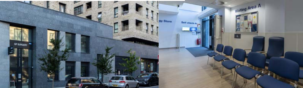
Acton Gardens Medical Centre, West London

The joining of 2 medical practices in London required the total redesign and fit out of a mixed use residential development. The new modern facility can now deliver healthcare services to the local area.