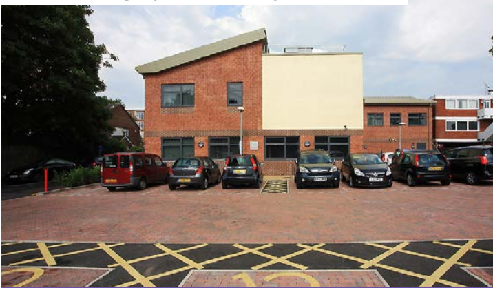
The Elms Surgery & Pharmacy, Potters Bar

We designed the facility which provides 1,100m² of dedicated Primary Care space alongside pharmacy accommodation. This scheme enables two practices to deliver high quality services from thoroughly modern premises to over 15,500 patients.