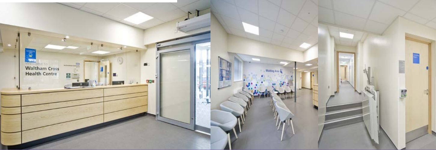
Waltham Cross Health Clinic, Hertfordshire

Refurbishment, extension and creation of a Covid Hot Site, providing 636 sqm NHS Trust space, updated to current HTM and HBN standards.