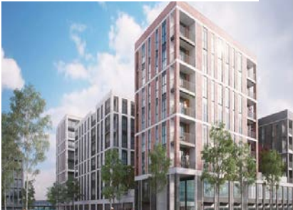
Beam Park Medical Centre

New build 1500sqm community health hub in Dagenham.